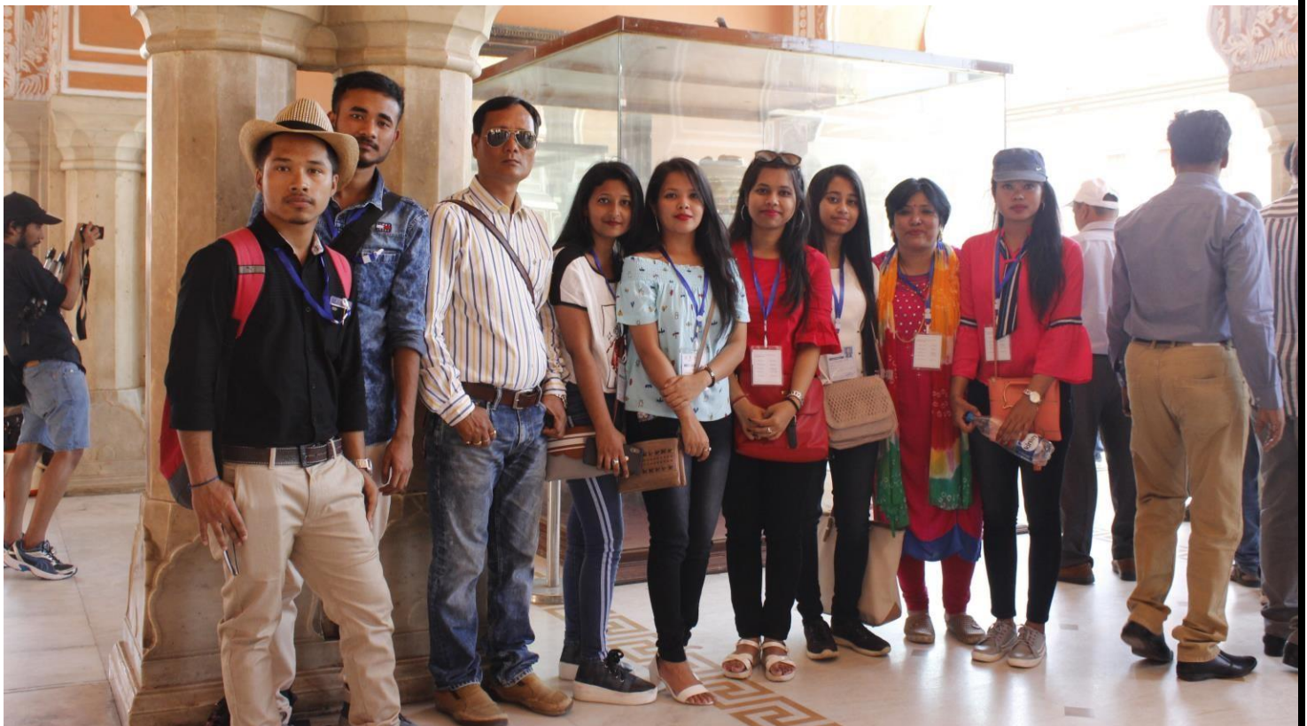
A GROUP PHOTO OF THE STUDENTS OF ELECTRONICS & TELECOMMUNICAION ENGINEERING DEPARTMENT ALONG WITH THE TEACHERS (AT CITY PALACE)