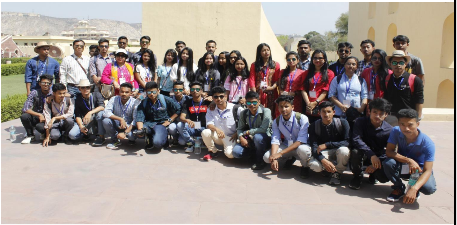
A GROUP PHOTO OF THE STUDENTS OF H. R. H. THE POWIET, JORHAT ALONG WITH THE TEACHERS (AT JANTAR MANTAR)